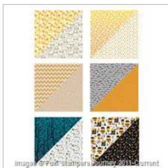
Fall Fest Prints