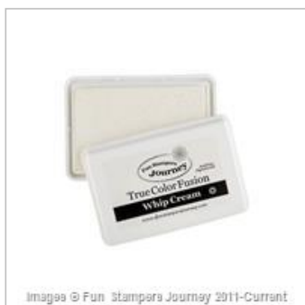
Whip Cream True Color Fusion Ink Pad