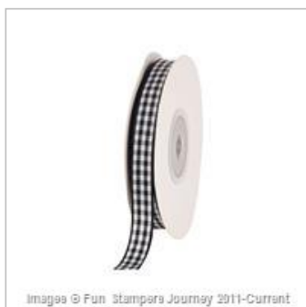
Gingham Ribbon Black Licorice