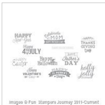
Annual Celebration Stamp Set