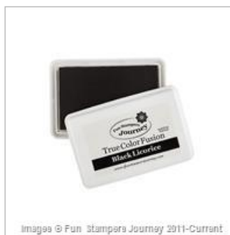
Black Licorice True Color Fusion Ink Pad