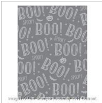
Spooky Bold Embossing Folder

www.funstampersjourney.com/byrdsblessings