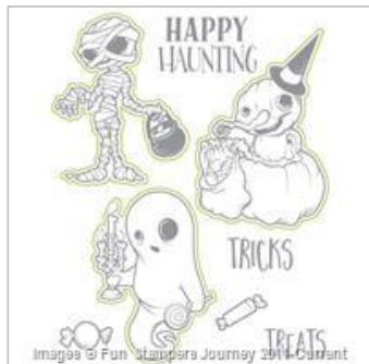
Ghostly Treats Bundle