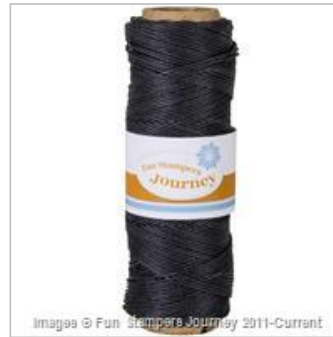
Journey Twine Black Licorice