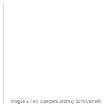
Whip Cream 8.5 x 11