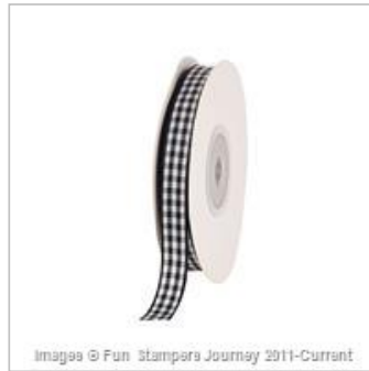
Gingham Ribbon Black Licorice