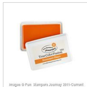
Summer Days True Color Fusion Ink Pad