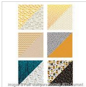
Fall Fest Prints